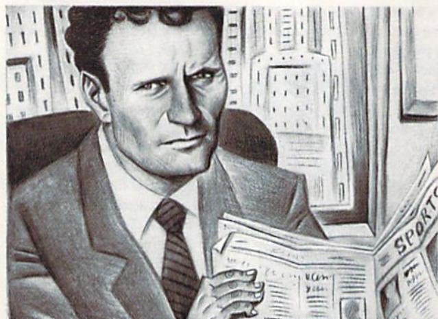
Investment banker upset to realize that last year not only did he make less than a former colleague who now runs a hedge fund but he also made less than a journeyman outfielder who now plays for the New York Mets