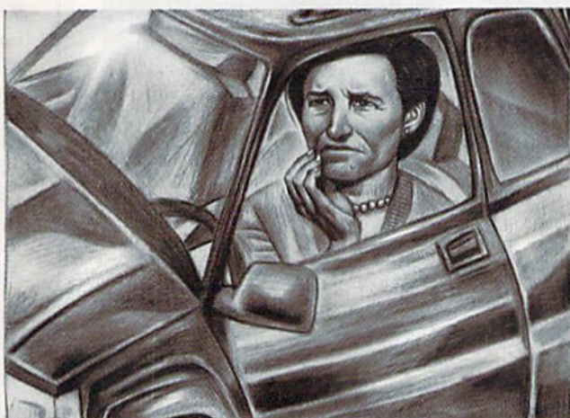
Woman disturbed at being the only mother at the Greenwich Country Day School who's still driving a 2006 Cadillac Escalade when everyone else is driving 2007 Porsche Cayennes