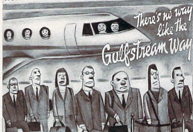
Line of senior vice presidents humiliated by the fact that they have to “fly commercial”